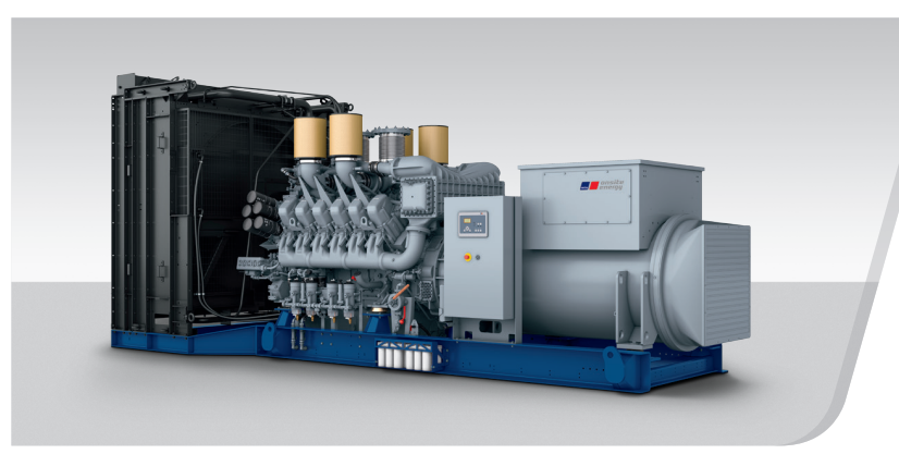
Optional equipment and finishing shown. Standard may vary.

380V – 11 kV/50 Hz/Prime Power for Stationary Emergency/NEA (ORDE) Optimized MTU 12V4000G14F/Water Charge Air Cooling